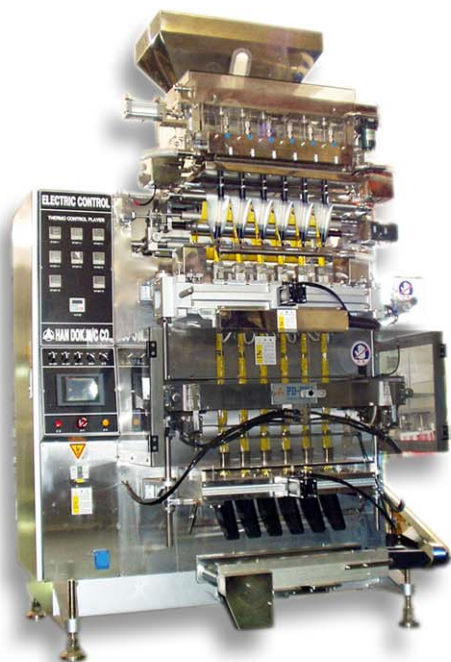
6 Lane Stick Pack Machine