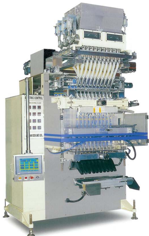
10 Lane Stick Pack Machine